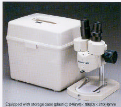
Equipped with storage case (plastic): 245(W) × 186(D) × 210(H)mm

Specifications are subject to change without notice.